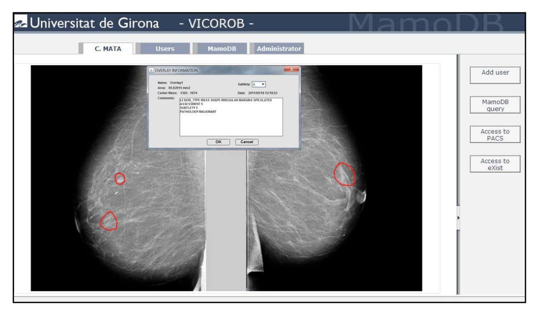
Figure 7. Display the DICOM images with their associated overlays. It is also possible to obtain the description about each overlay.